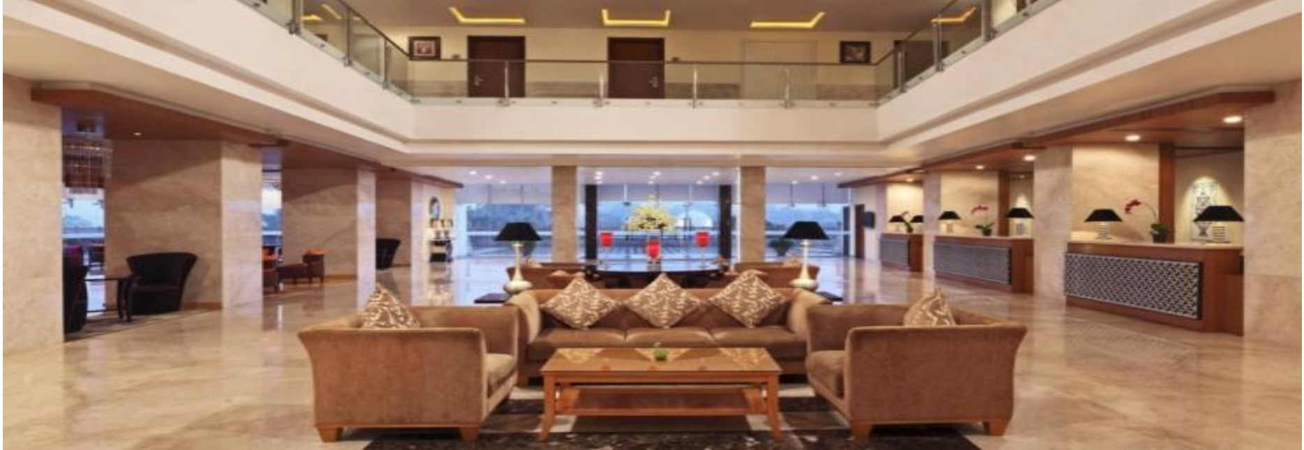
Lobby & Lounge Area